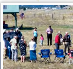
GOD CAN DO IT