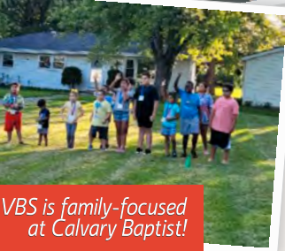
VBS is family-focused at Calvary Baptist!

Calvary Baptist is located in an ethnically diverse neighborhood where VBS is culturally-acceptable to attend (even if one is, for example, Catholic and VBS is held at a Baptist church). Every year there are children who make professions of faith.