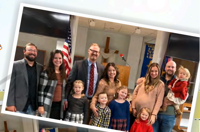
First Sunday at City of Light!