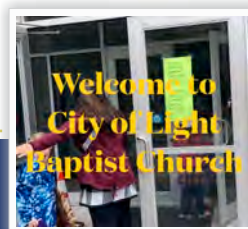
HELLO, FROM BUFFALO!