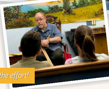
VBS is worth the effort!