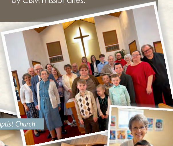
Calvary Baptist Church

A recent gift helped cover the cost of a website for Calvary Baptist Church, and the church family is enthusiastic about the possibilities. ( www.calvarybaptist.life )