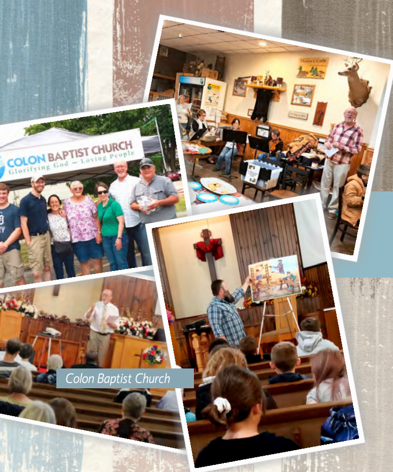
Colon Baptist Church